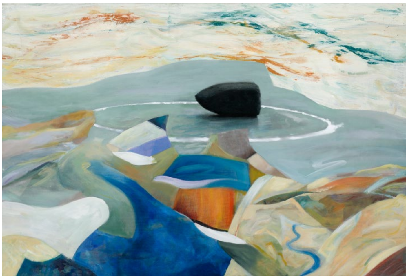
Mirel Vieru - Fragmentary Narrative I, 2024 oil, colored pencil, acrylic primer, print on canvas 53 x 79 cm