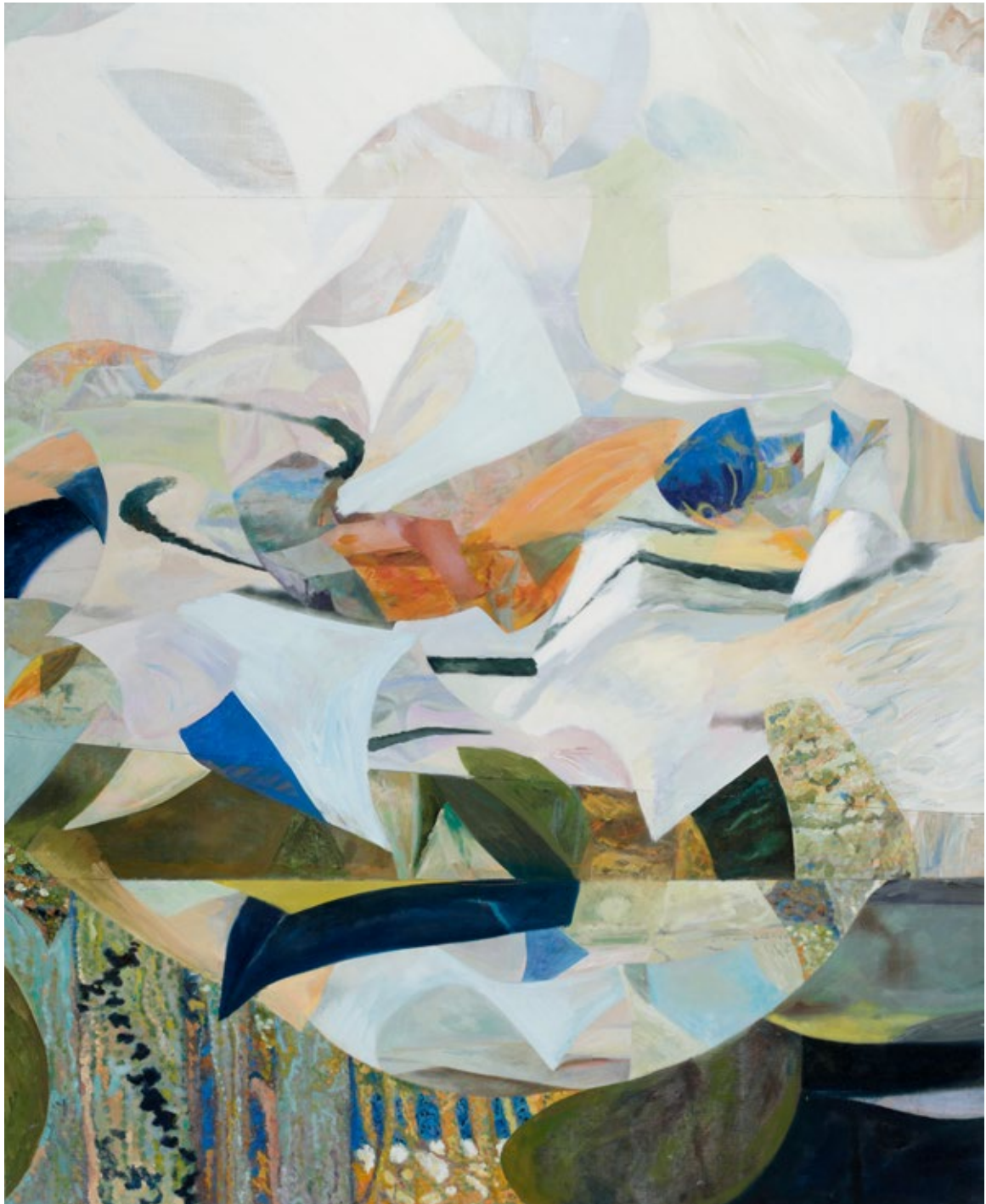
Mirel Vieru - Discontinuity, Boundary and Fracture III, 2024 collage, oil, colored pencil, watercolor, print on canvas 155 x 125 cm