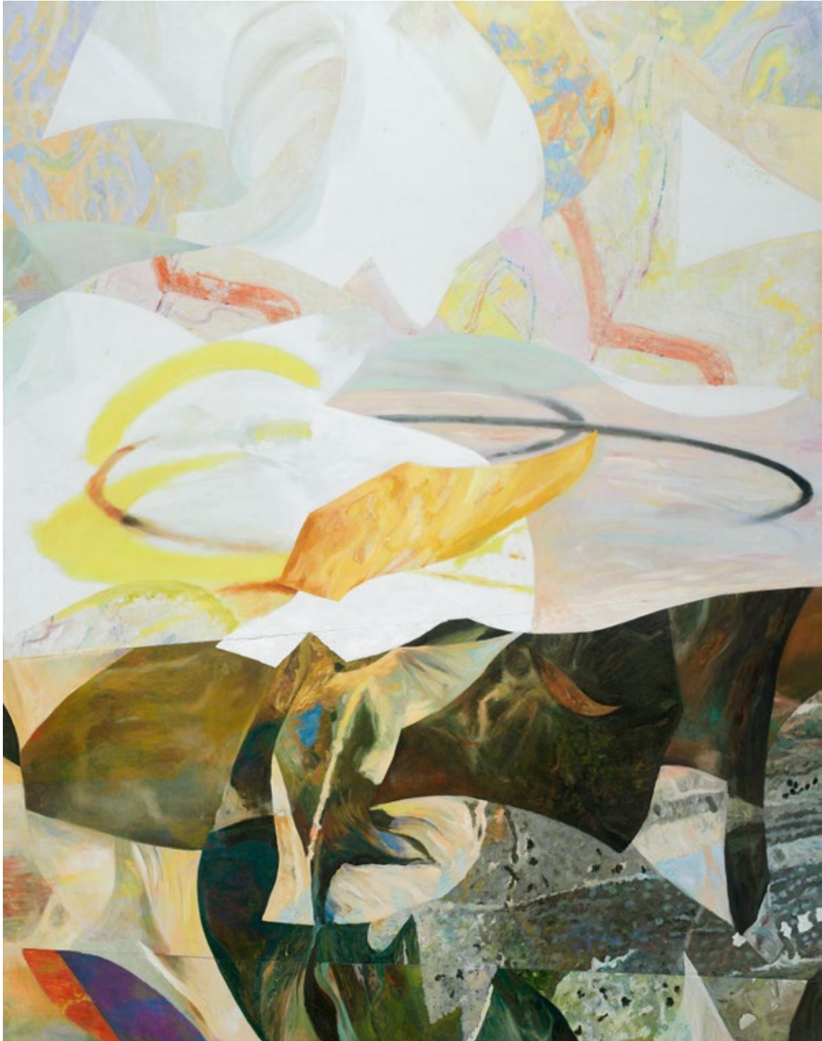
Mirel Vieru - Discontinuity, Boundary and Fracture I, 2024 collage, oil, colored pencil, watercolor, print on canvas 180 x 140 cm