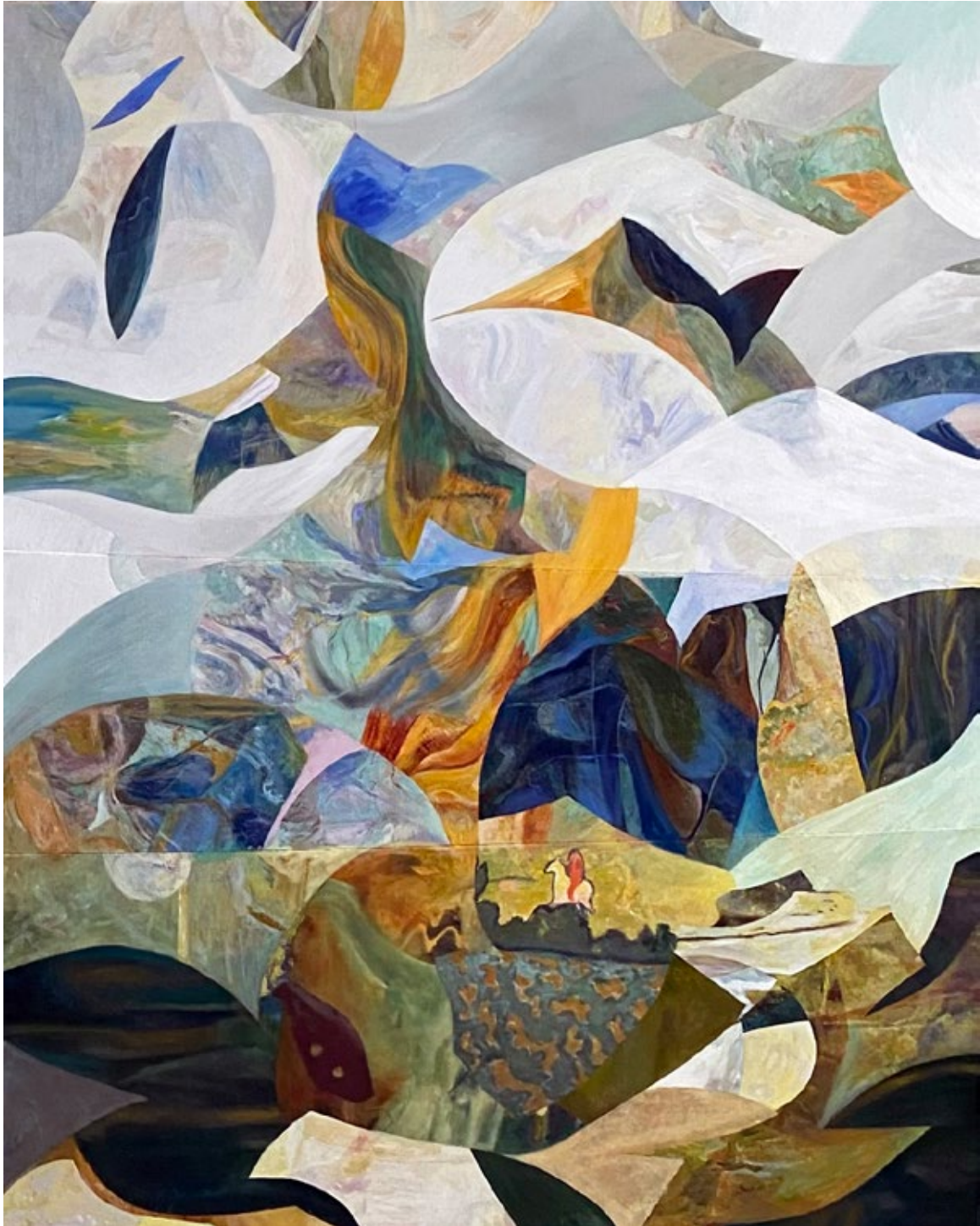
Mirel Vieru - Discontinuity, Boundary and Fracture V, 2025

collage, oil, colored pencil, watercolor, print on canvas 152 x 120 cm