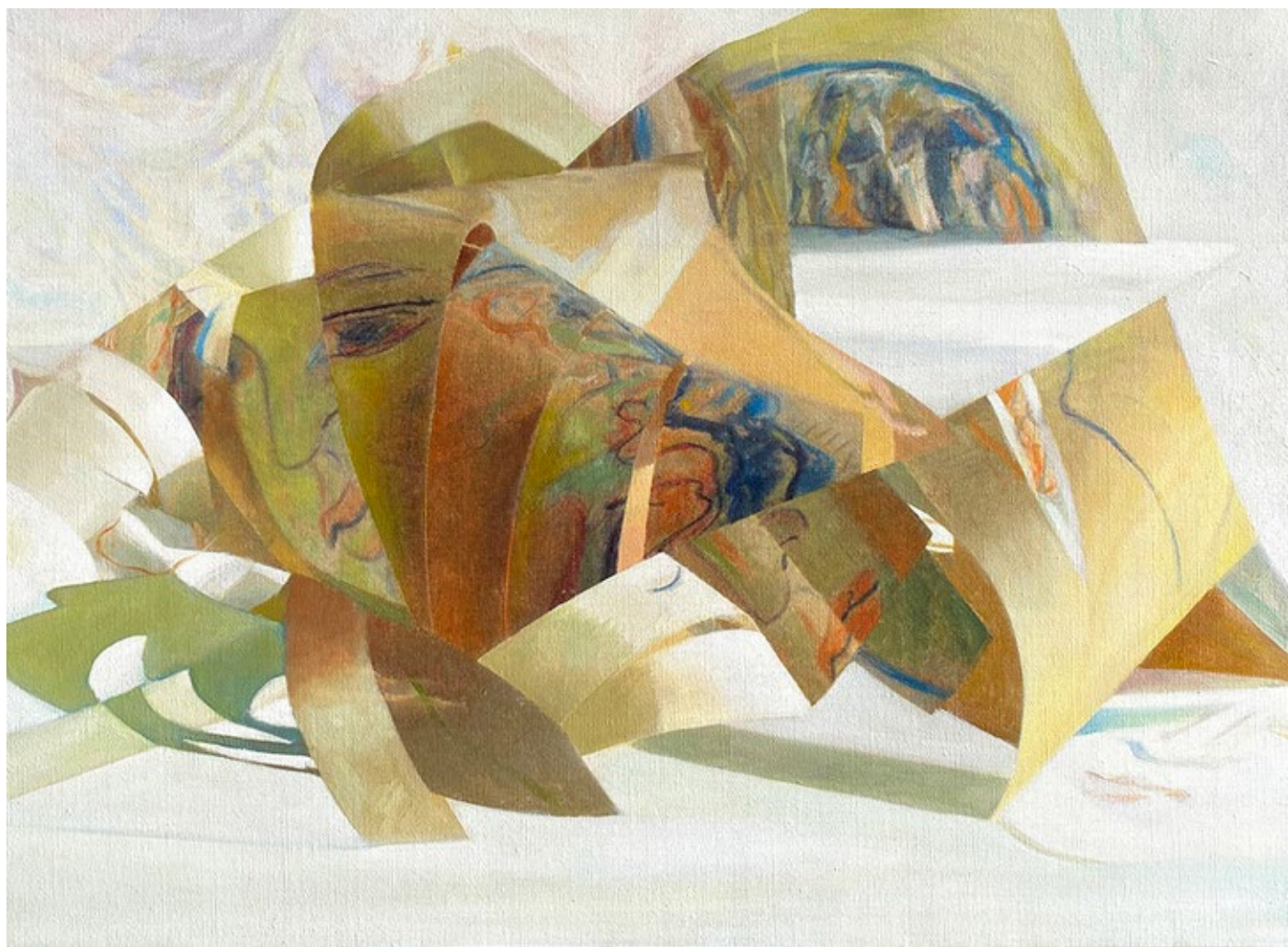
Mirel Vieru - Fragmentary Identity II, 2025 oil, colored pencil, watercolor, print on canvas 58 x 80 cm