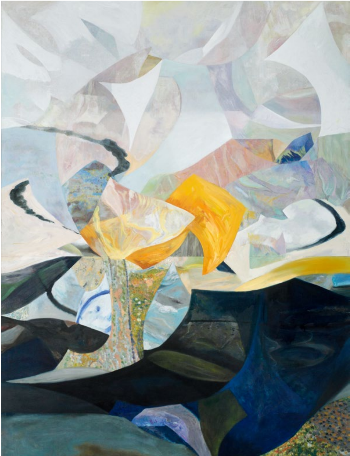
Mirel Vieru - Discontinuity, Limit and Fracture II, 2024 collage, oil, colored pencil, watercolor, print on canvas 170 x 130 cm