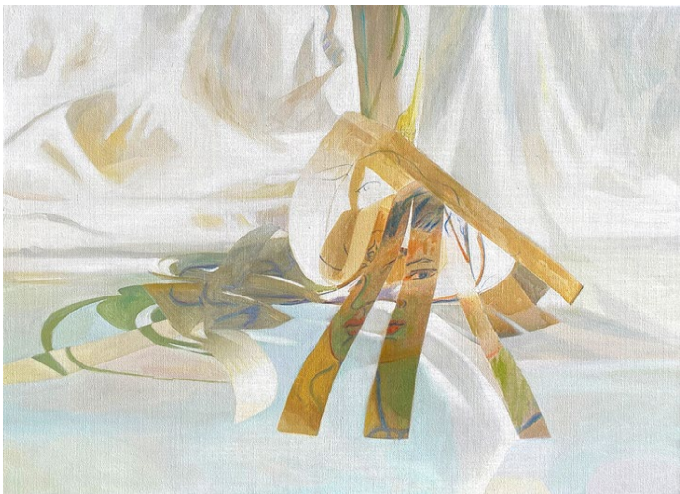
Mirel Vieru - Fragmentary Identity I, 2024 oil, colored pencil, watercolor, print on canvas 58 x 80 cm