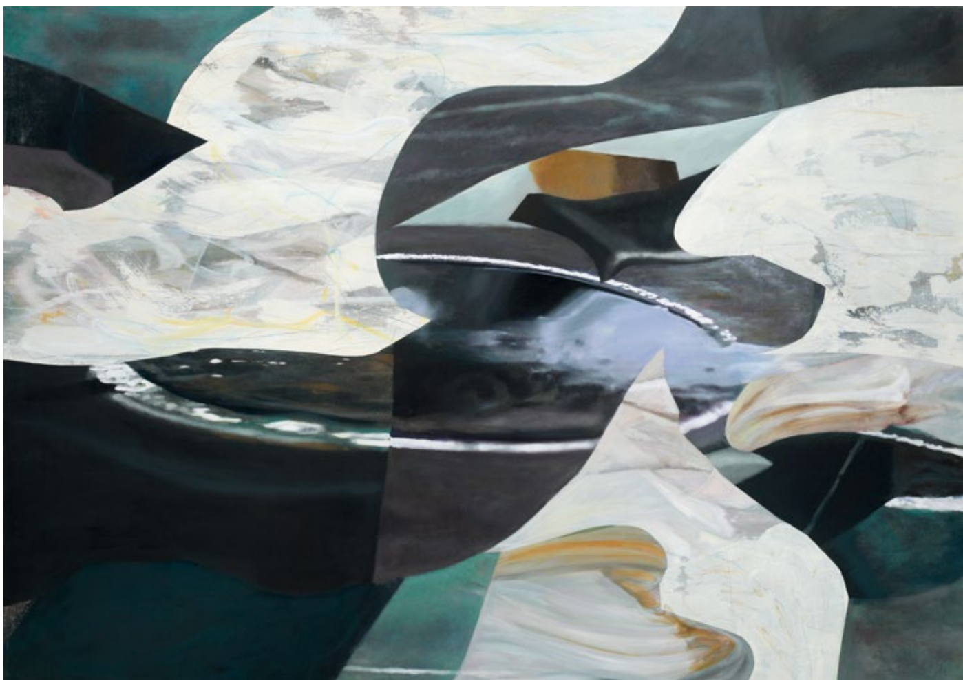
Mirel Vieru - The fragment as essential discontinuity I, 2024 oil, colored pencil, acrylic primer, print on canvas 140 x 200 cm