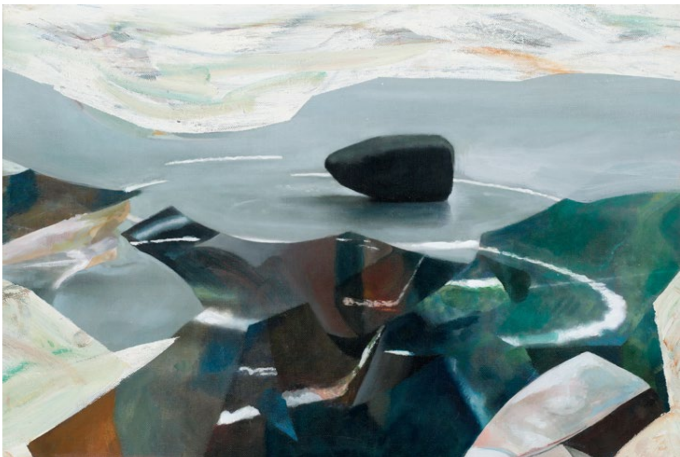
Mirel Vieru - Fragmentary Narrative II, 2024 oil, colored pencil, acrylic primer, print on canvas 46 x 69 cm