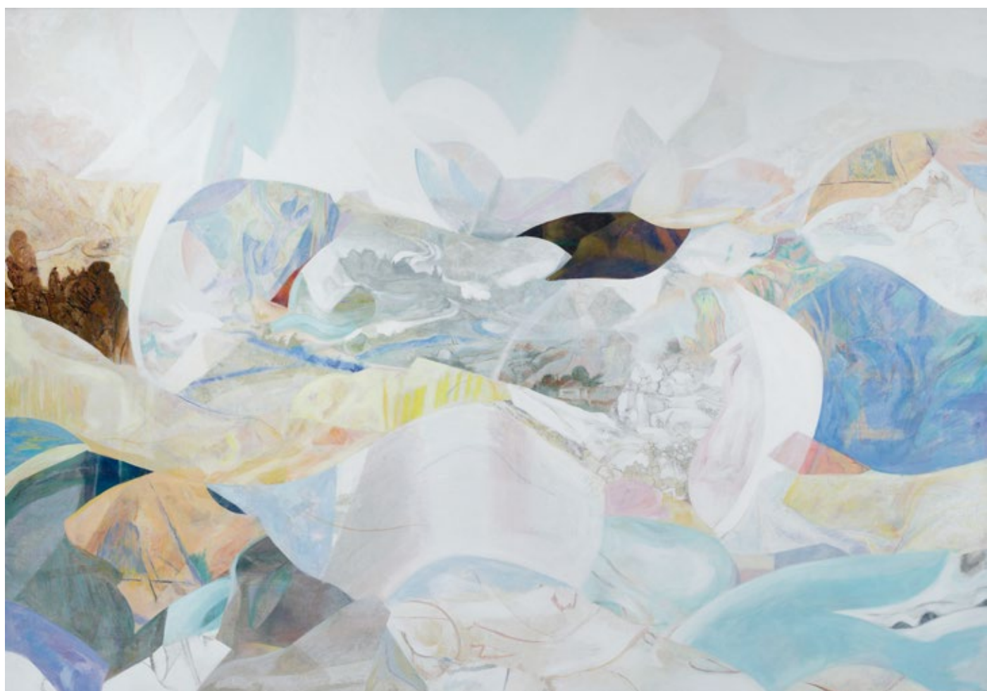
Mirel Vieru - Horizon that limits and opens, 2024 oil, colored pencil, watercolor, print on canvas 150 x 215 cm