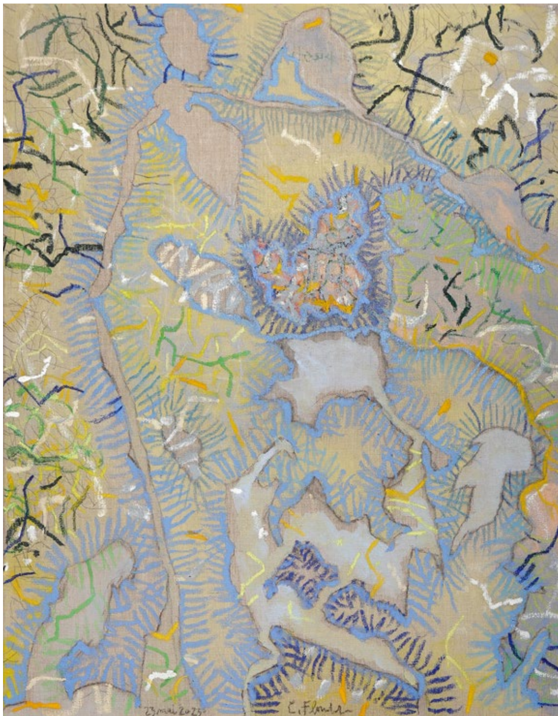
Constantin Flondor - Contemplation of Nature / Spaces between leaves, 2023

oil stick and pencil on canvas 70 x 50 cm