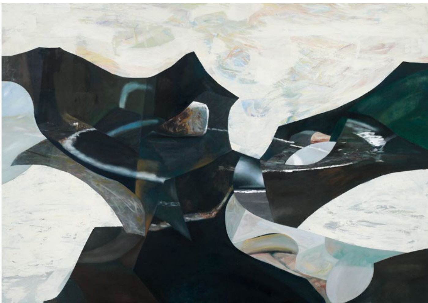
Mirel Vieru - The fragment as essential discontinuity II, 2024

oil, colored pencil, acrylic primer, print on canvas 140 x 200 cm