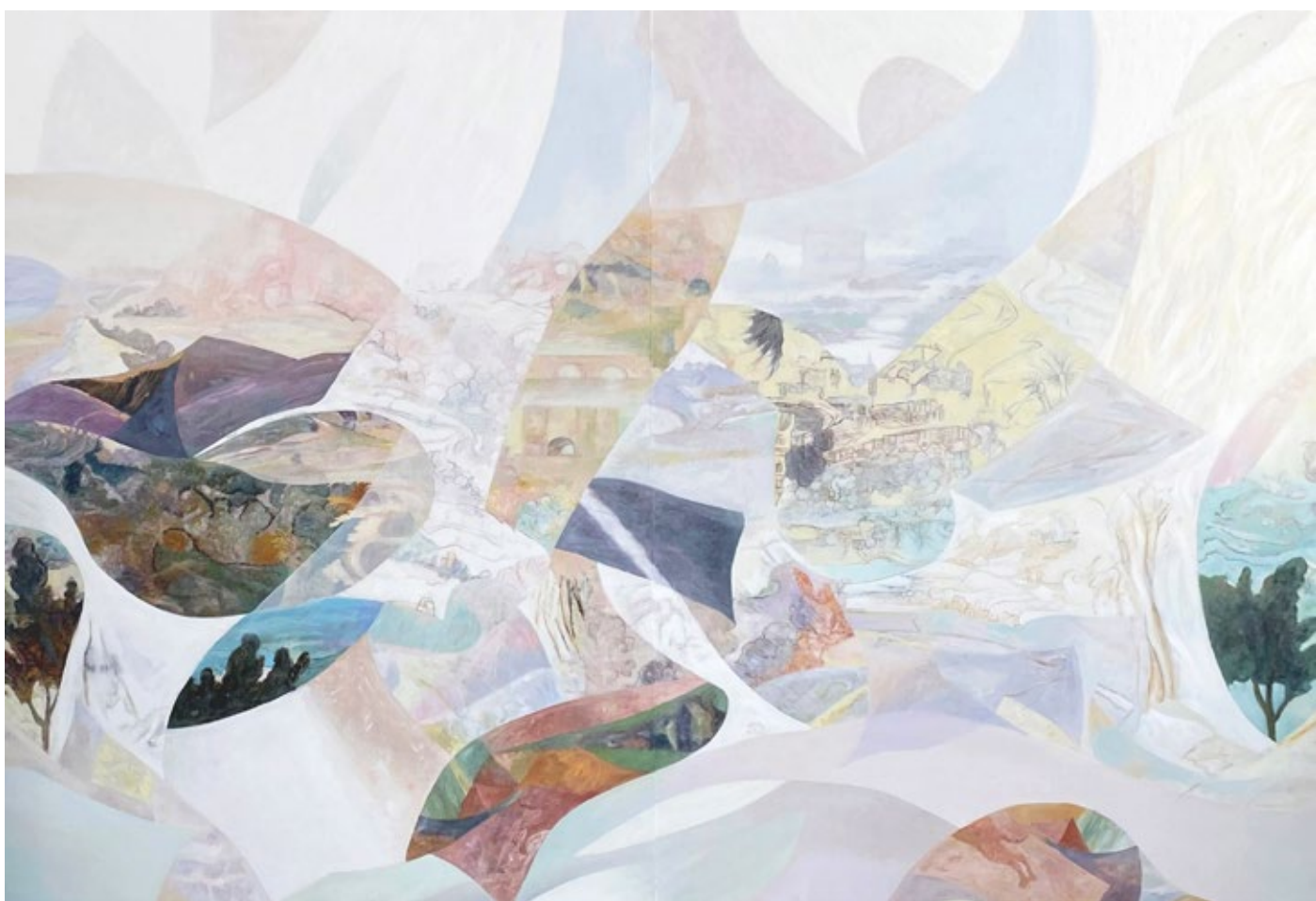
Mirel Vieru - Horizon that limits and opens II, 2025 collage, oil, colored pencil, watercolor, print on canvas 176 x 260 cm